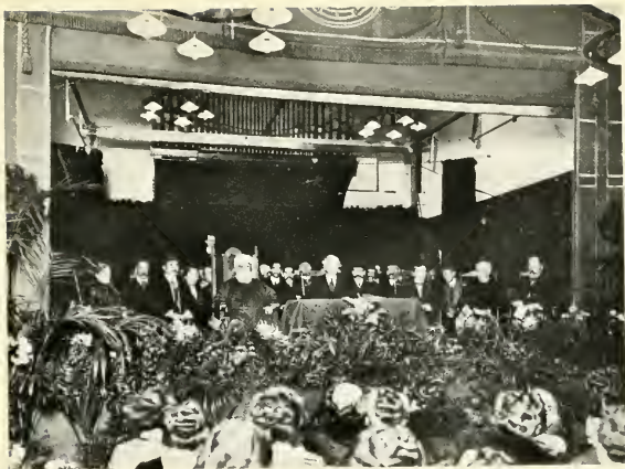
ABDUL BAHÁ IN A MEETING OF BAHÁIS IN LONDON